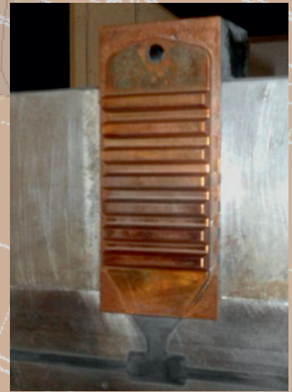
HOVAVENT® vacuum-venting in hard workday life