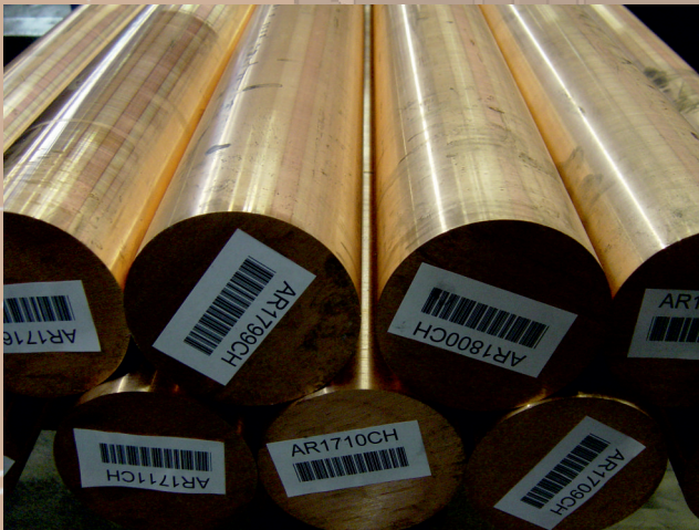
wrought material HOVADUR® CNCS and CCNB