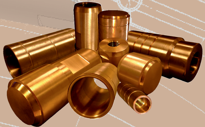
piston according to customer's specification